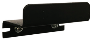
DEP Hanger Bracket Kit 830-1250