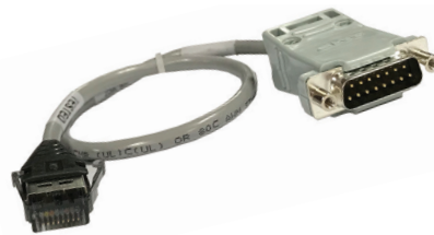
DB15 to SDL Adapter Cable for legacy products 205-3607